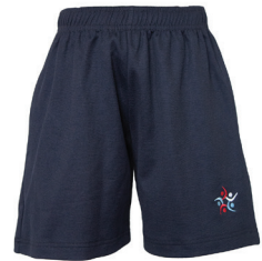
Sport Short Navy