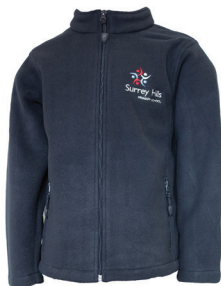
Polar Fleece Jacket