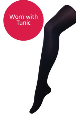
Worn with Tunic