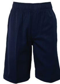
Shorts Pull On Gabardine