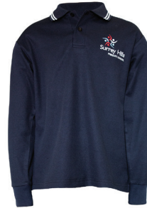
Polo Long Sleeve