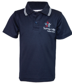
Polo Short Sleeve