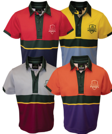
House Polo Junior Assorted House Colours