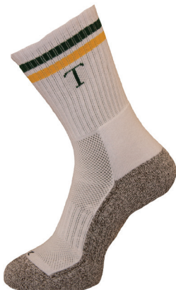
Sports Sock 2 pack

For current prices, please refer to www.bobstewart.com.au