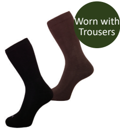
Socks Crew 3pk