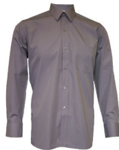
Shirt Long Sleeve