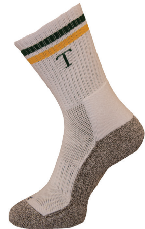
Sports Sock 2 pack