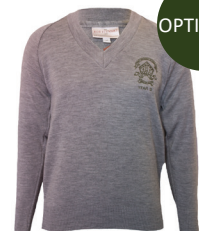
Yr 12 Pullover