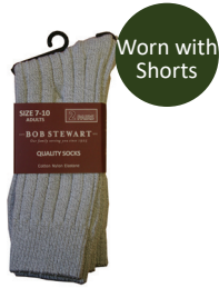
Socks short walk 2pk