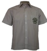
Senior Summer Shirt