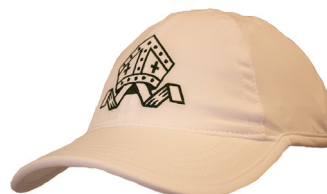
Cap - Green or White