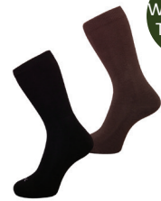
Socks Crew 3pk