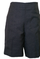
Shorts Pull On Pinhead