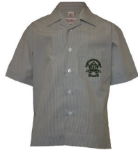
Junior Summer Shirt