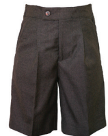
Shorts Elastic Back Pinhead