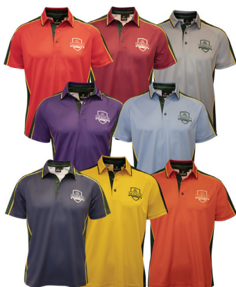
House Polo Senior Assorted House Colours