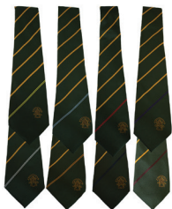
Tie - House Colours