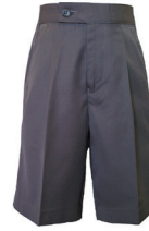
Shorts Elastic Back