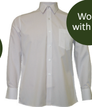
Long Sleeve Shirt