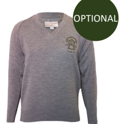
Yr 12 Pullover