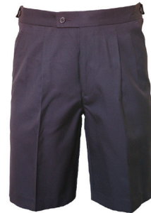
Senior Shorts Navy