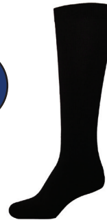
Black Knee High Socks