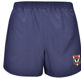
Sport Shorts with inner