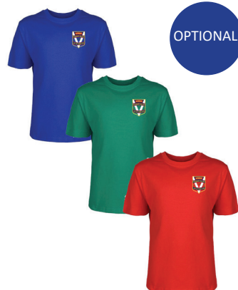
House T Shirt