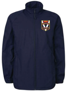
Softshell Jacket Unisex