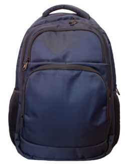
School Backpack Navy