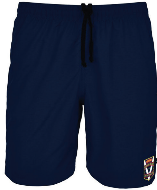
Sport Shorts Unisex