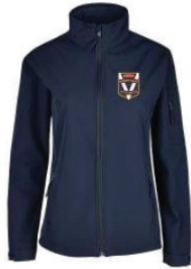
Softshell Jacket Tailored