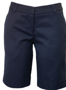
Tailored Shorts Navy