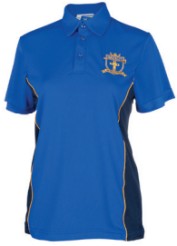
Polo Short Sleeve