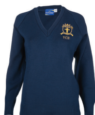
Pullover Ink VCE Yr11-12