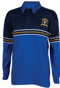
Rugby Top - Yr7 - Yr12