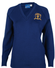
Pullover Navy Yr7 -10