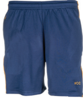
Sport Shorts Navy