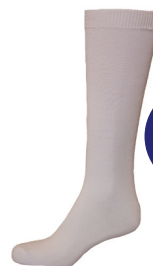
White Knee High Socks