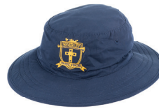
Navy Hybrid Hat