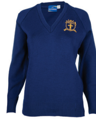
Pullover Navy Yr7 -10