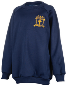
Windcheater - Prep to Gr6