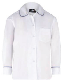
Junior Blouse Long Sleeve