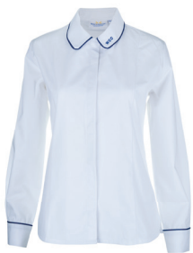
Blouse Long Sleeve with logo