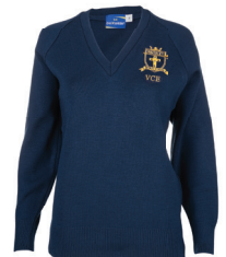
Pullover Ink VCE Yr11-12