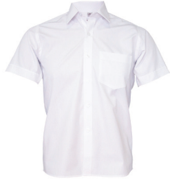
Short Sleeve Shirt