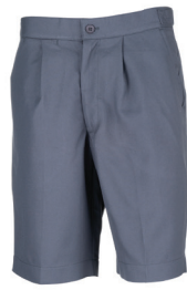
Shorts Grey with side tabs