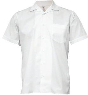
Short Sleeve Shirt, Open Neck