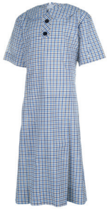
Summer Dress - Peter Pan Collar