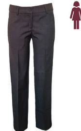
Tailored Pants Grey Melange