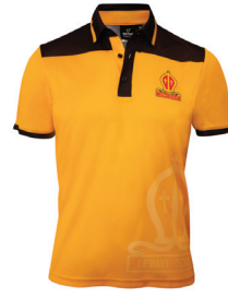
House Polo Hughes