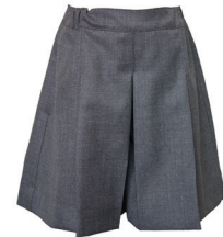
Skort Prep - 2