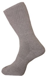
Socks grey marle 2pkt