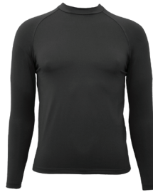
Rashi Bathers Top