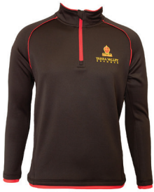
QTR zip Top