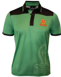
House Polo Plummer