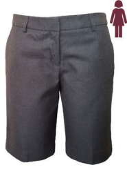
Shorts Tailored Dark Grey