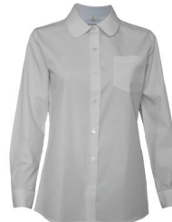
Blouse Peter Pan Prep - 2