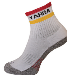
Sport Socks 2pkt