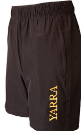
Sport Short Unisex