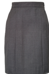
Skirt Yrs 3 - 6