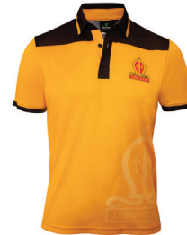
House Polo Hughes