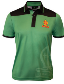
House Polo Plummer