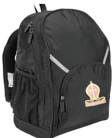
Unopak Prep - 3