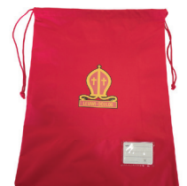
Swim / Library Bag

For current prices, please refer to www.bobstewart.com.au