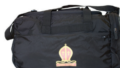
Senior Sports Bag