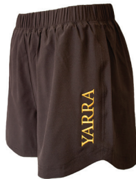
Sport Short Girls