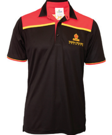
Interschool Sports Polo Compulsory Yr 4-6 / Yr 3 if selected