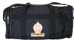
Junior Sports Bag