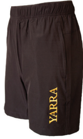
Sport Short Unisex