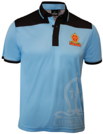
House Polo Annellis