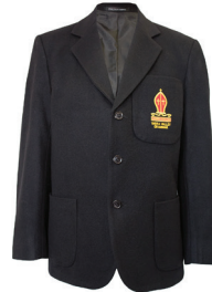
Blazer Unisex Yr 3-6