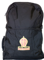
Chiropak Yrs 3-6