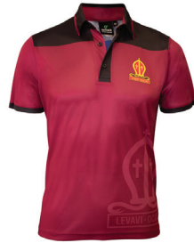
House Polo Arnott