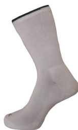
Socks white with stripe