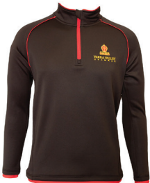
QTR Zip Top