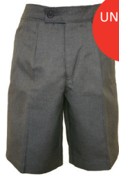
Shorts Fly Front Yr 3-6 Grey Melange