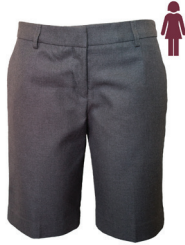
Shorts Tailored Dark Grey