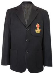
Blazer Unisex Yr 3-6