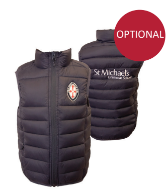
Puffer Vest (Optional)