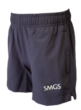
Sport Shorts (Compulsory)