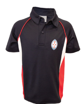
Short Sleeve Polo (Compulsory)