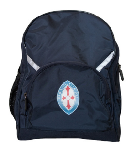
Backpack - UNO