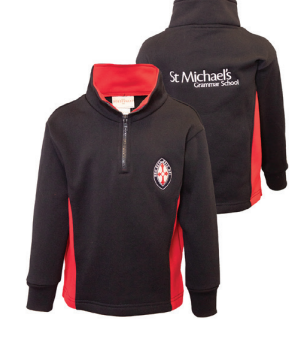
Junior Track Top (Compulsory)