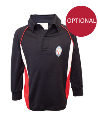
Long Sleeve Polo (Optional)