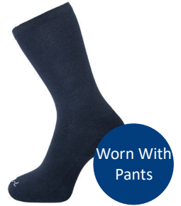
Sock Crew Navy 3pkt