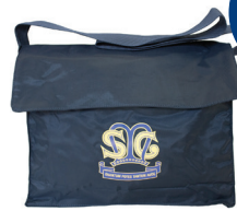
Satchel School Bag