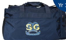
Team Sports Bag