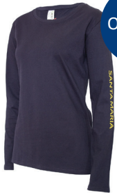
Sports T Long Sleeve