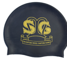
Swim Cap Squad