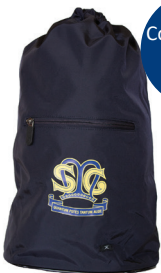
Havasak Sports Bag