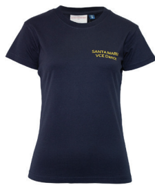
VCE Dance T-Shirt