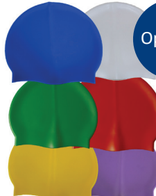
Swim Cap House